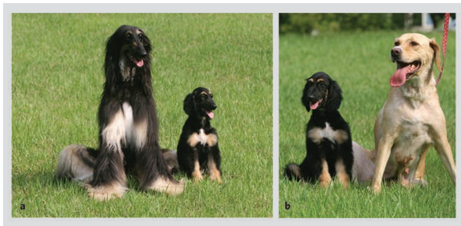
Figure 1 | Dog cloned by somatic-cell nuclear transfer. a , Snuppy, the first cloned dog, at 67 days after birth (right), with the three-year-old male Afghan hound (left) whose somatic skin cells were used to clone him. Snuppy is genetically identical to the donor Afghan hound. b , Snuppy (left) was implanted as an early embryo into a surrogate mother, the yellow Labrador retriever on the right, and raised by her.

Three pregnancies were confirmed by ultrasound scans at 22 days' gestation in recipients after transfer of constructs. Pregnancy was established only after embryo transfer of very-early-stage nuclear-transfer constructs (that is,